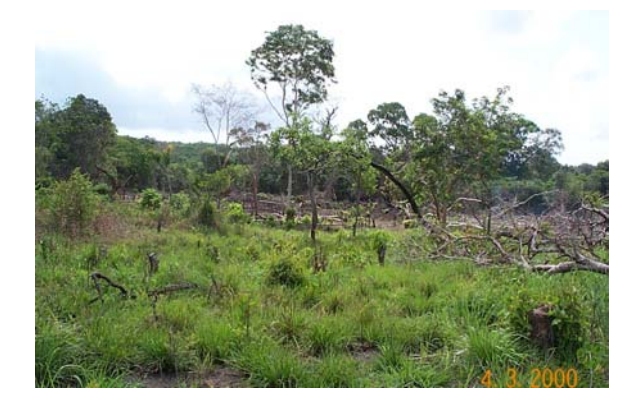
Mjawa deforestation due to charcoal and cultivation