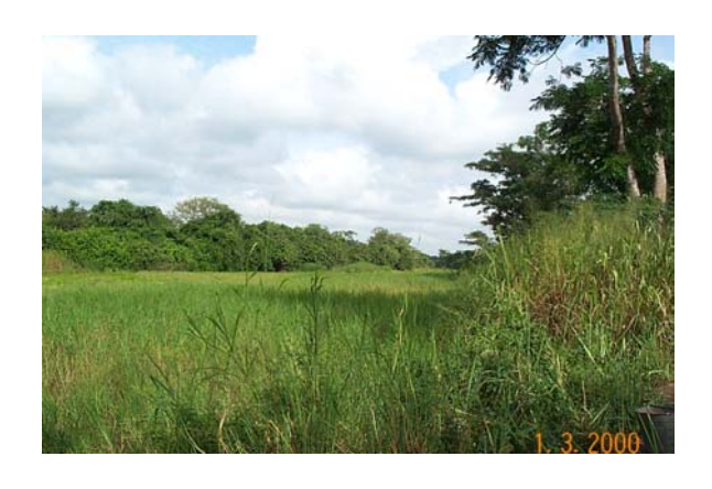
Portion of Lake Shella