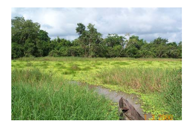
Lake Shella – area for fetching water.