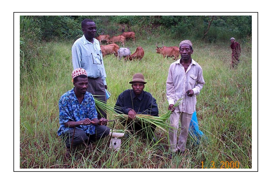
Technical Report No. 40 (Muthasari wa Kiswahili Upo) June 2003