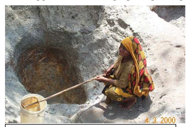
Woman fetching water for over 4 hours at Mjawa