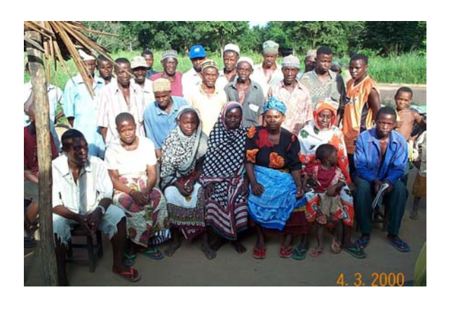
Bungu B. Village meeting