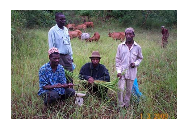
MUHORO - grazing area for Mlekwa Njoro