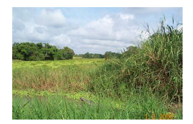
Lake Shella watering point