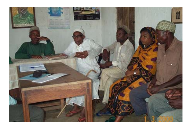
Muhoro – Sungapwani sub-village