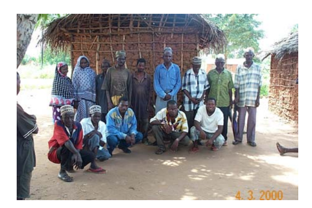
Uponda village meeting – Blue shirt is chairman