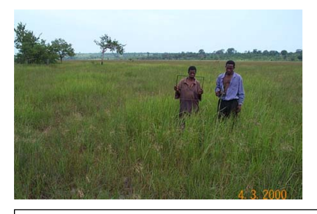
Uponda Potential Grazing area called Uchembe