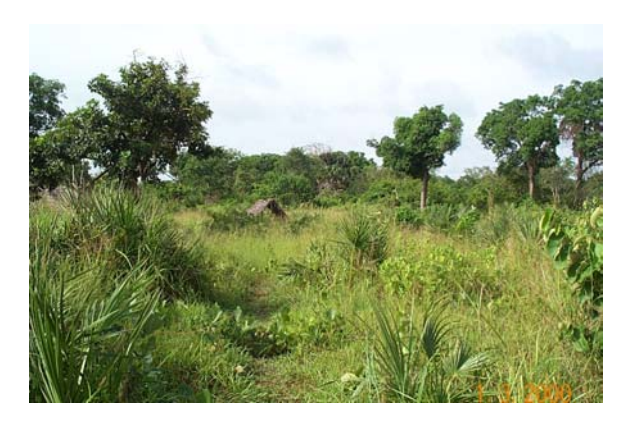
Potential Grazing area Nyambawala