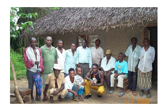
KIWANGA Village members