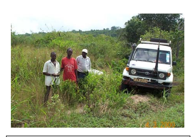
Mjawa grazing area – Mianzini charcoal behind