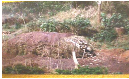
Figure 1. Typical charcoal kiln under preparation at Kitulungalo area.

Charcoal making process that is usually done in public lands involves wood cutting, kiln preparation, carbonisation and finally unloading charcoal from the kiln. While 13, 10 and 14 days are spent for wood cutting, kiln preparation and carbonization, respectively, unloading the charcoal kiln takes only about 4 days (Zahabu, 2001).